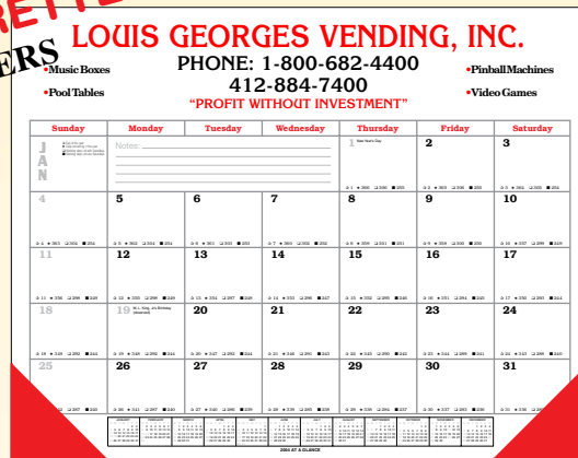
size 22" x 17¼"