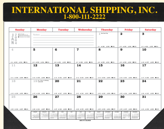
A149 size 22" x 17"