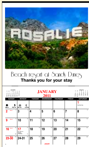
I-7 11" x 17" 1 Image