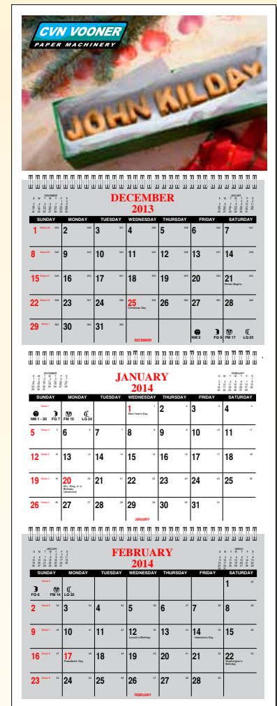
I-12 12"x32" 3 Month At Glance 1 Image