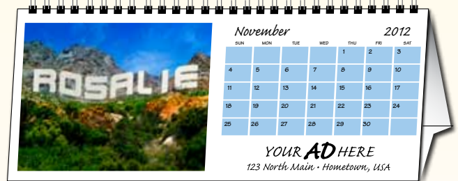
I-1144 12 Images 11" x 4.5" (13 sheets printed both sides) I-1140 12 Images 11" x 4.5" (12 sheets printed one side)