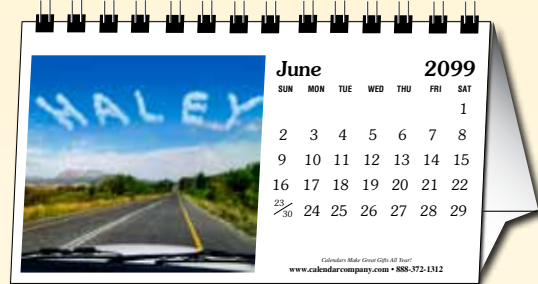
I-55 12 Images 5.5" x 3"