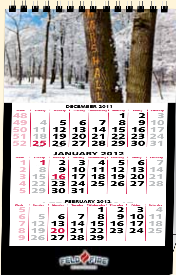
I-V1 12 Images 5.5" x 8.5"