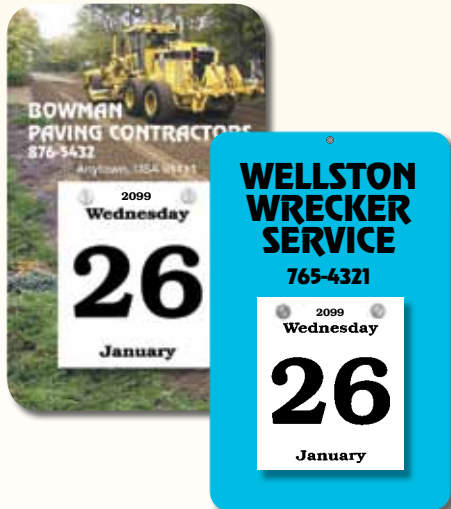
ADD1 size 7" x 11"